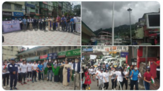
Ministry of Information & Broadcasting and 8 others