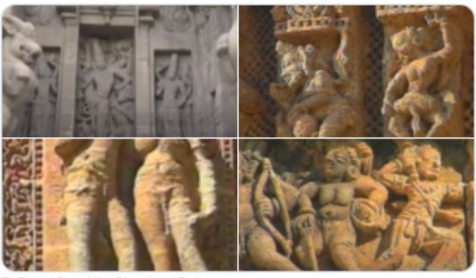
Fk Rharat Shreshtha Rharat and 7 others