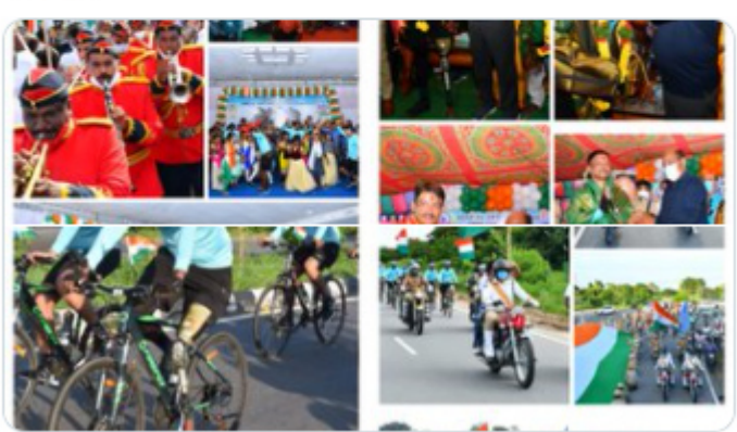
SOUTHERN SECTOR CRPF and 7 others